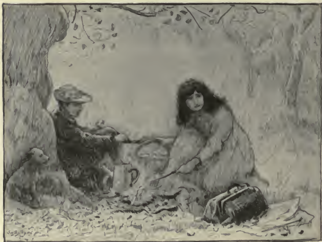
MEG LOOKED RATHER LIKE A LITTLE WITCH AS SHE STOOD OVER THE BUBBLING OLD POT.

So this eventful evening they lingered about until all the rest had gone, and even went their way with cautious glances about them when they crept out after supper to their trysting-place with matches, the battered old coffee-pot, and the eggs.